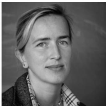
PROF. SANDRA VAN VLIERBERGHE Polymer Chemistry and Biomaterials Group (PBM)

The key objectives of the Polymer Chemistry Research Group (PCR) can be described under the general heading “design, characterization and application of tailor-made, functional polymer structures and polymeric-derived materials”.